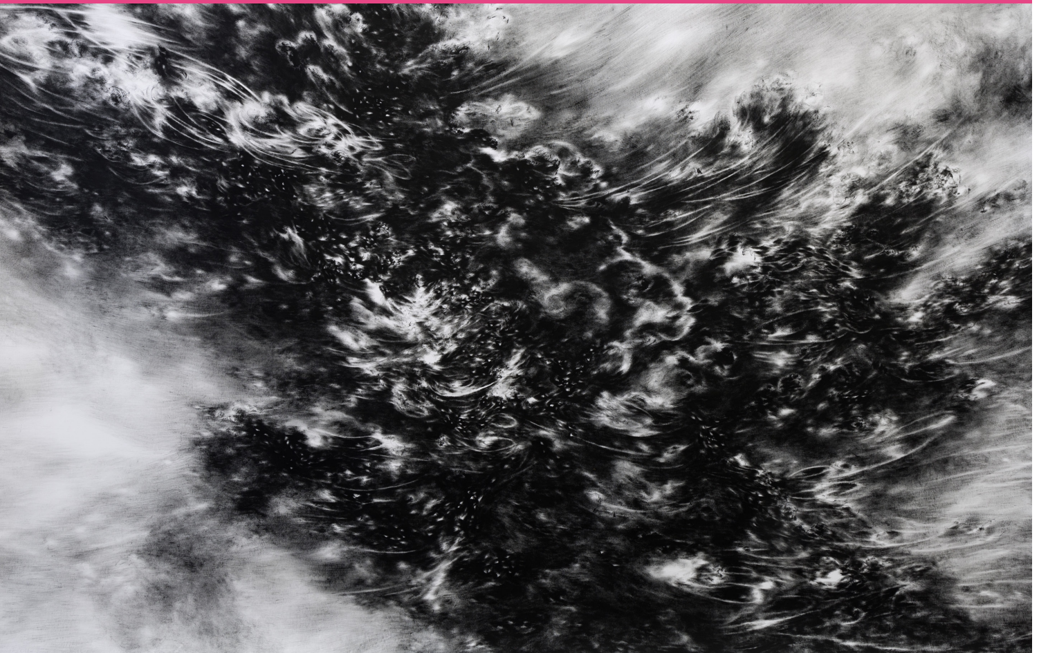
Julia Steiner, Detail of «untitled», 2014, 203 x 240 cm, gouache on paper.

MONDAY, 11 SEPTEMBER TO TUESDAY 12 SEPTEMBER 2017, WOLFSBERG, ERMATINGEN